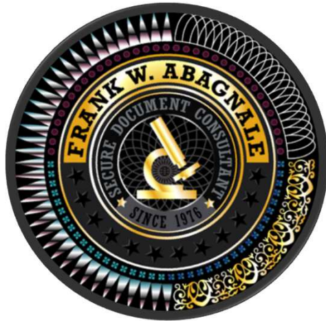
Frank W. Abagnale